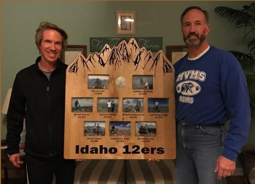
Plaque shown in pictures made from solid birch.